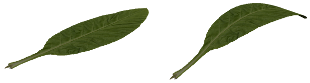
Figure 2: Example showing the default model with no bending (left side) and a model with a slight bend towards the ground (right side).

The attribute extraction was done in two steps. In the first step, the plant was segmented into leaves using a spatial clustering algorithm. In the second step, attribute extraction was done using a leaf model fitting algorithm. In the course of this algorithm, a model leaf is transformed until it fits the segmented leaf. From the resulting transformation the values of the attribute vector can be calculated. Further details of the attribute extraction methods can be found in [Uhrmann et al. , 2013]. An example of the result can be seen in figure 3.