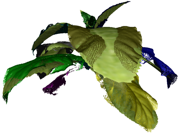
Figure 3: The result of the model fitting algorithm. Each leaf (shown in different colors) has a model leaf fitted to it.