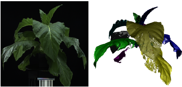
Figure 1: Picture of a 52 days old tobacco plant (left side) and the corresponding 3D reconstruction (right side). Each leaf is shown in a different color.

The measurements were carried out using a sheet-of-light measuring system developed at the Fraunhofer IIS . This system projects laser light onto the plant, which is then captured by several cameras. The cameras are positioned below, above and in front of the plant. In the measuring process, the plant is turned about 360 degrees to expose all plant parts to the cameras. During the rotation, the distance from the plant to the camera is measured by tracking the positions of the points where the laser light was reflected on the plant's surface. The result is a 3D point cloud of the plant surface. An example for the result is given in figure 1.